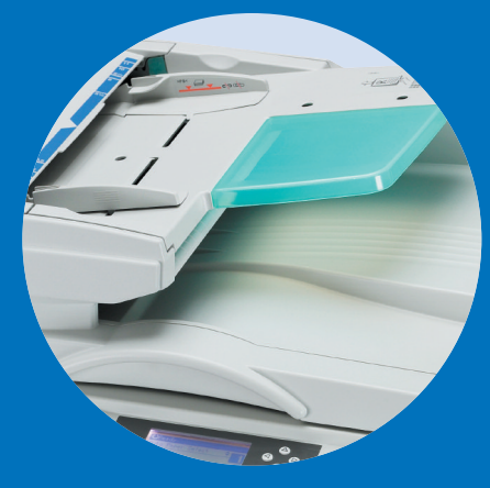
Automatic Duplexing (8020d with optional ARDF) lets you copy and print two-sided documents – up to 11" x 17" – which significantly reduces paper, hardcopy storage and postage costs.